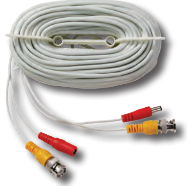
60' BNC Video & DC Power Cable